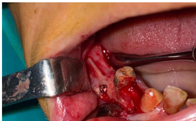
Figure 7. Bone image five months after augmentation

Two dental implants were applied and waited for osteointegration (Fig. 8a, 8b). After the 3-month healing process, healing caps were placed in order to shape the gums and ten days later, the prosthesis phase was started.