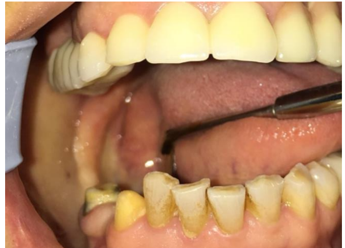
Figure 1. Intraoral view of the patient