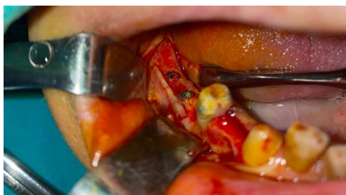
Figure 8a. Application of dental implants