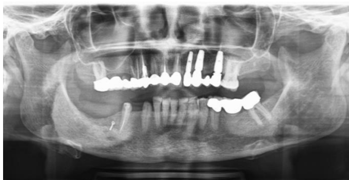
Figure 6b. Postoperative panoramic view

Sharp edges and corners were corrected to prevent flap perforation. In order to provide tension-free closure of the wound margins, incisions were made to release the periosteum. The defect area was covered with a pericardial membrane in order to preserve the volume of allogeneic bone granules during the healing process and to prevent soft tissue growth in the relevant area. The pericardium membrane was sutured in the periosteum using 5.0 vicril suture. Finally, the flap was sutured with 3.0 silk in a position where the wound margins came together without tension (Fig. 6a, 6b). After about 5 months of healing, an incision was made in the relevant area to perform dental implant application. It was observed that the allogeneic cortical strut was well integrated into the newly formed bone tissue (Fig. 7).