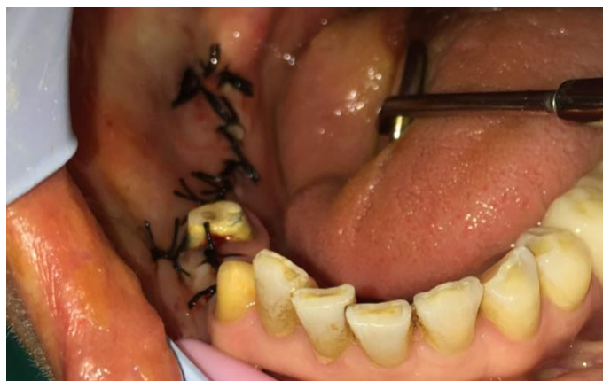
Figure 6a. Postoperative intraoral view of the patient