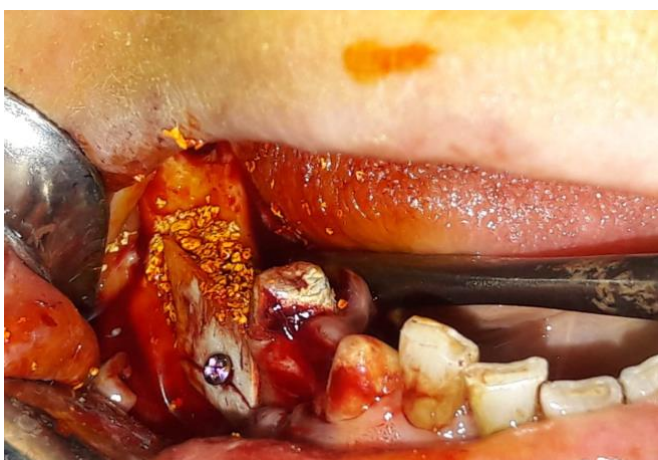
Figure 5. Application of allogeneic cortical block graft and particle grafts