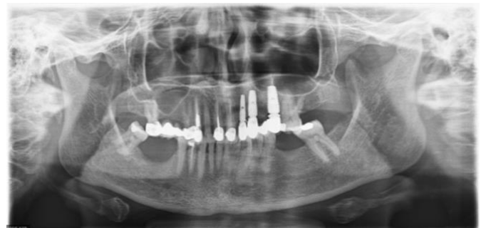
Figure 2. Preoperative panoramic radiography