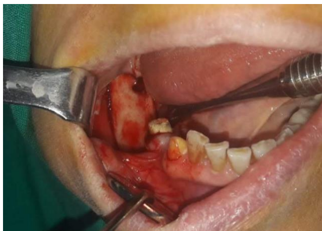
Figure 4. Intraoperative bone defect image